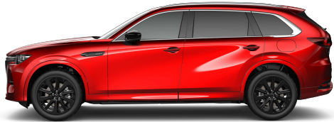
Soul Red Crystal Metallic (46V)