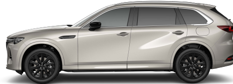
Platinum Quartz Metallic (47S)