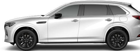
Rhodium White Metallic (51K)