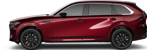
Artisan Red Metallic (51F)