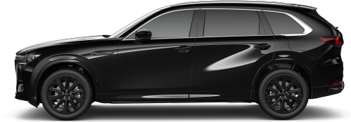
Jet Black Mica (41W)