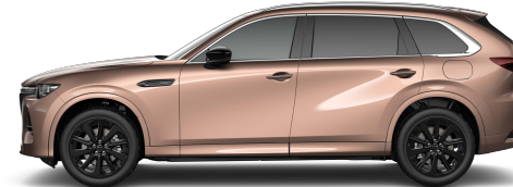
Melting Copper Metallic (52H)