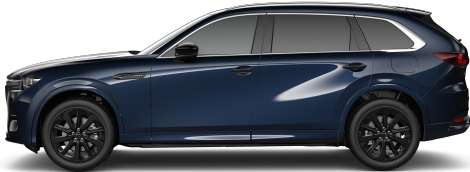
Deep Crystal Blue Mica (42M)