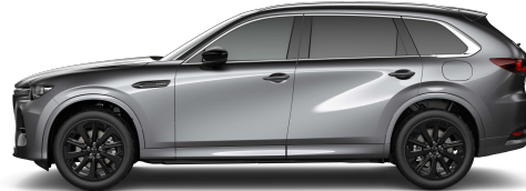
Machine Grey Metallic (46G)