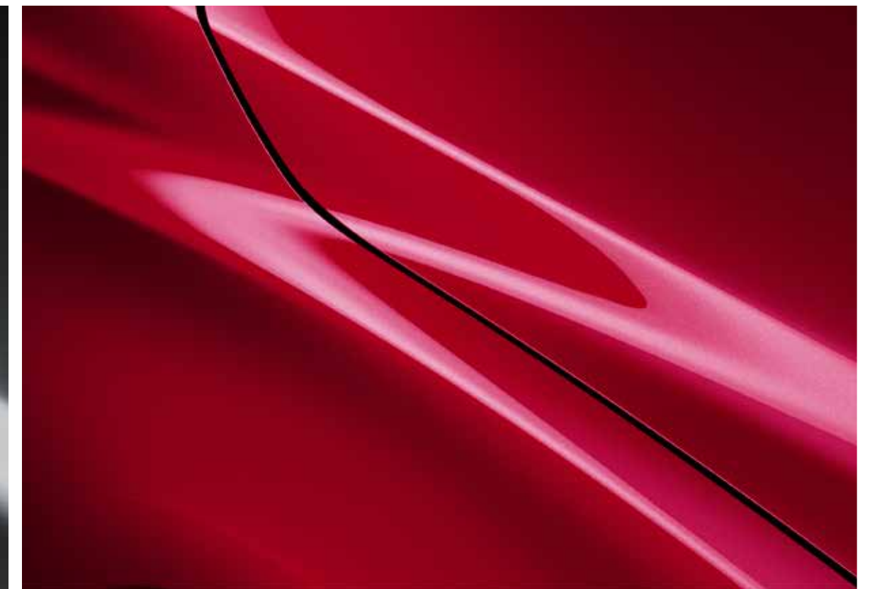
Soul Red Crystal Metallic ^