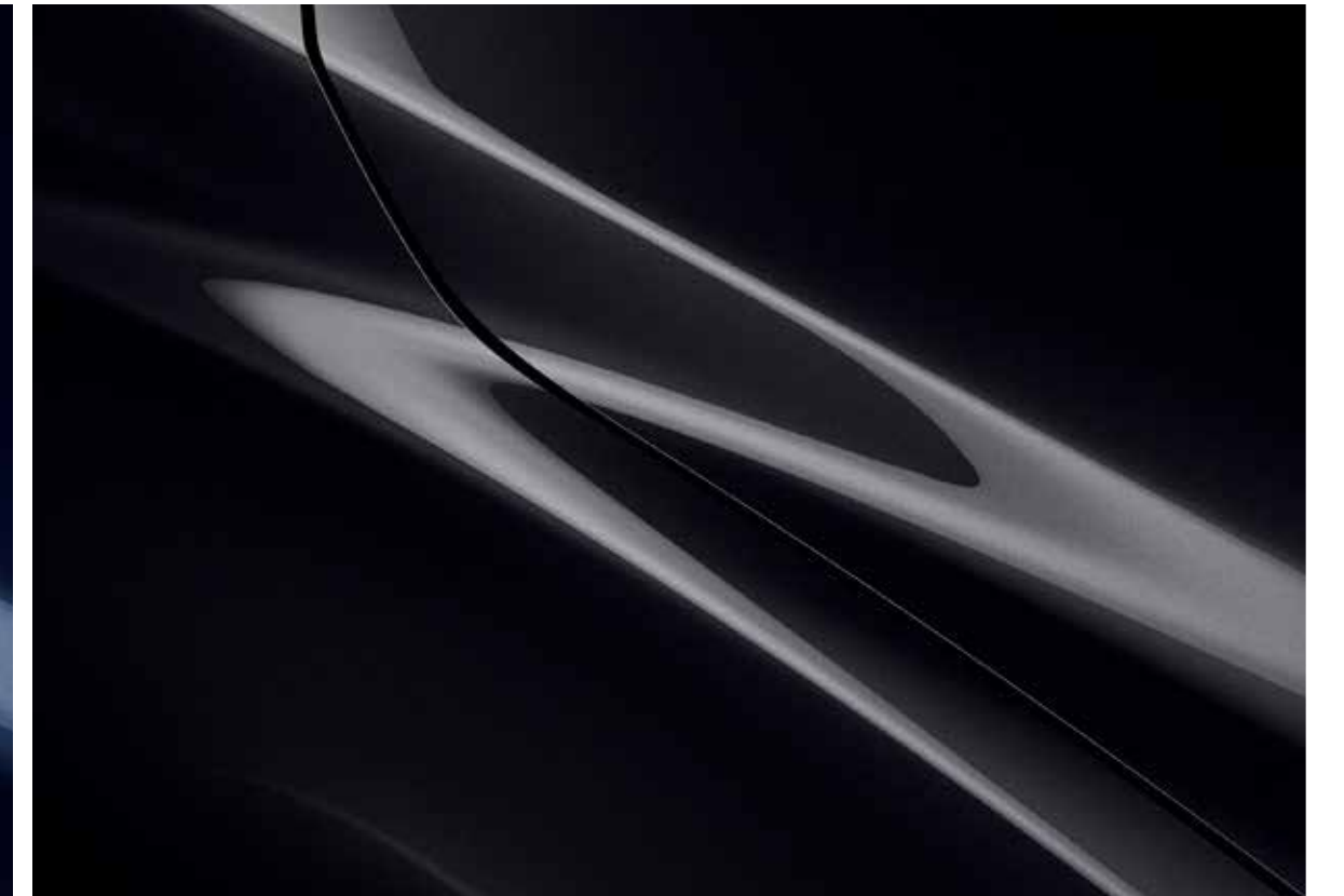
Jet Black Mica