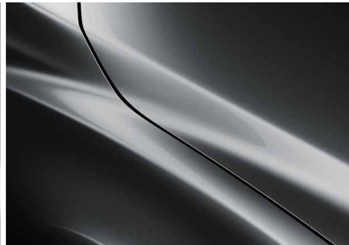
Machine Grey Metallic ^