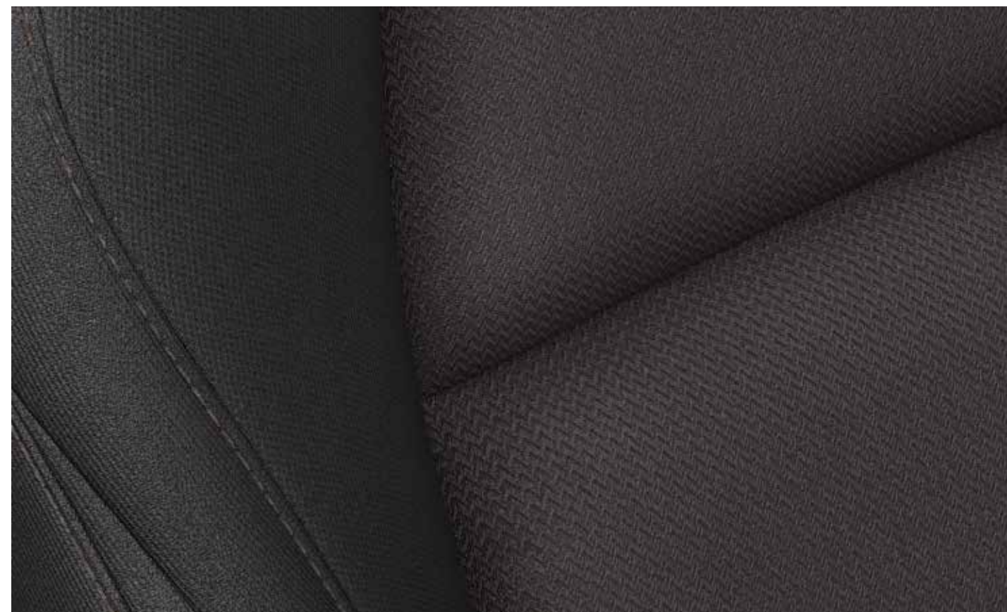
Black Cloth (GSX, GTX)