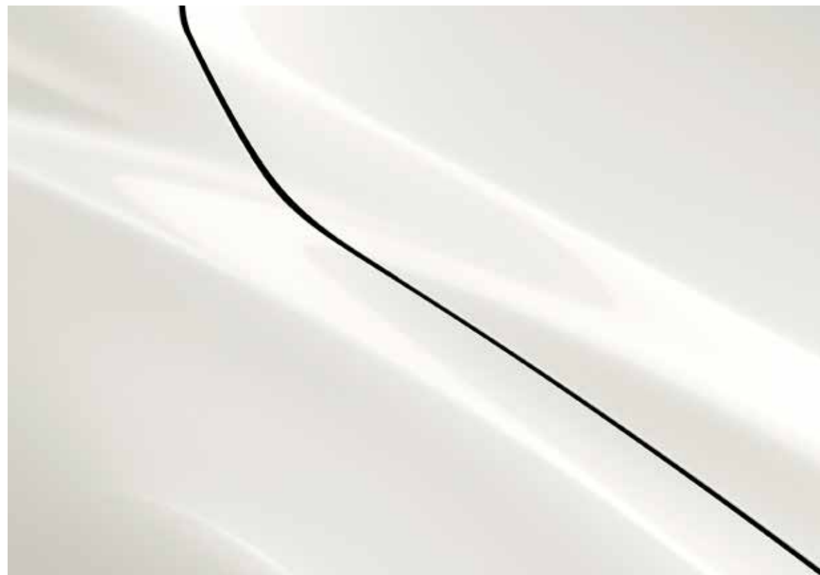
Snowflake White Pearl Mica