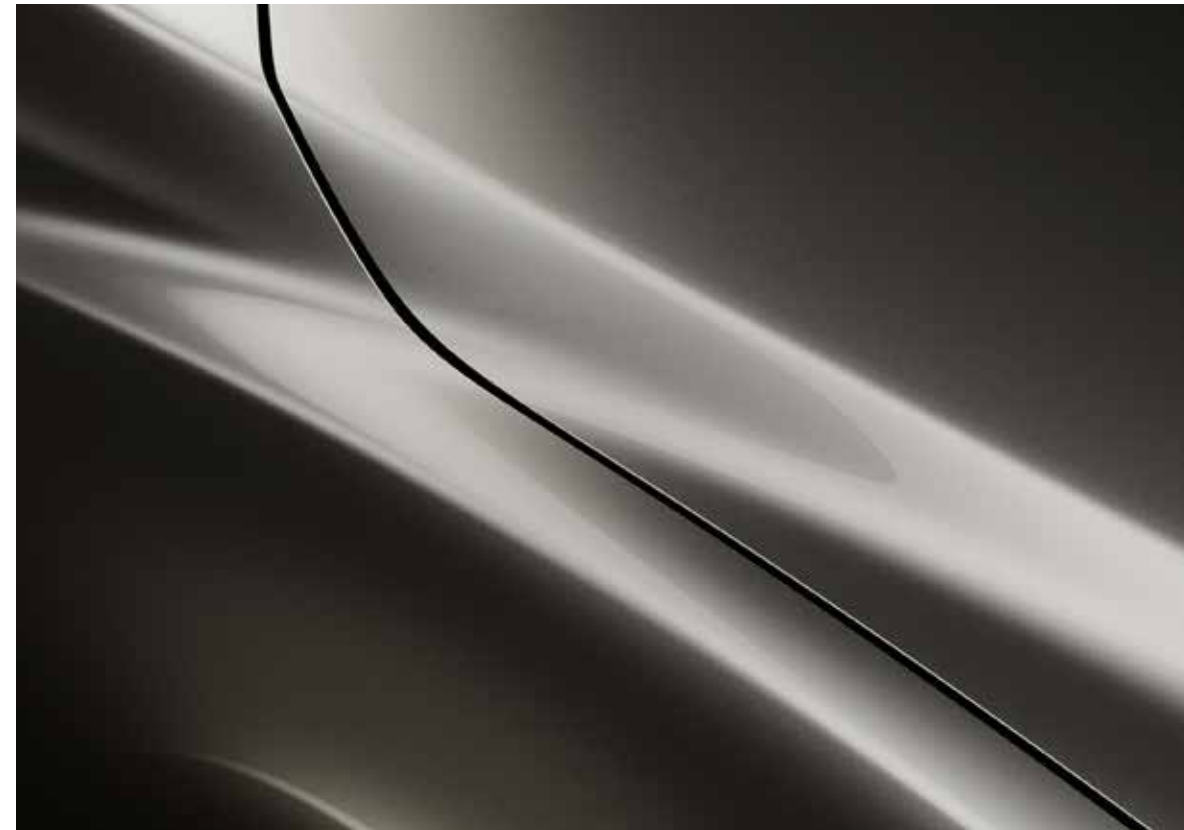
Titanium Flash Mica