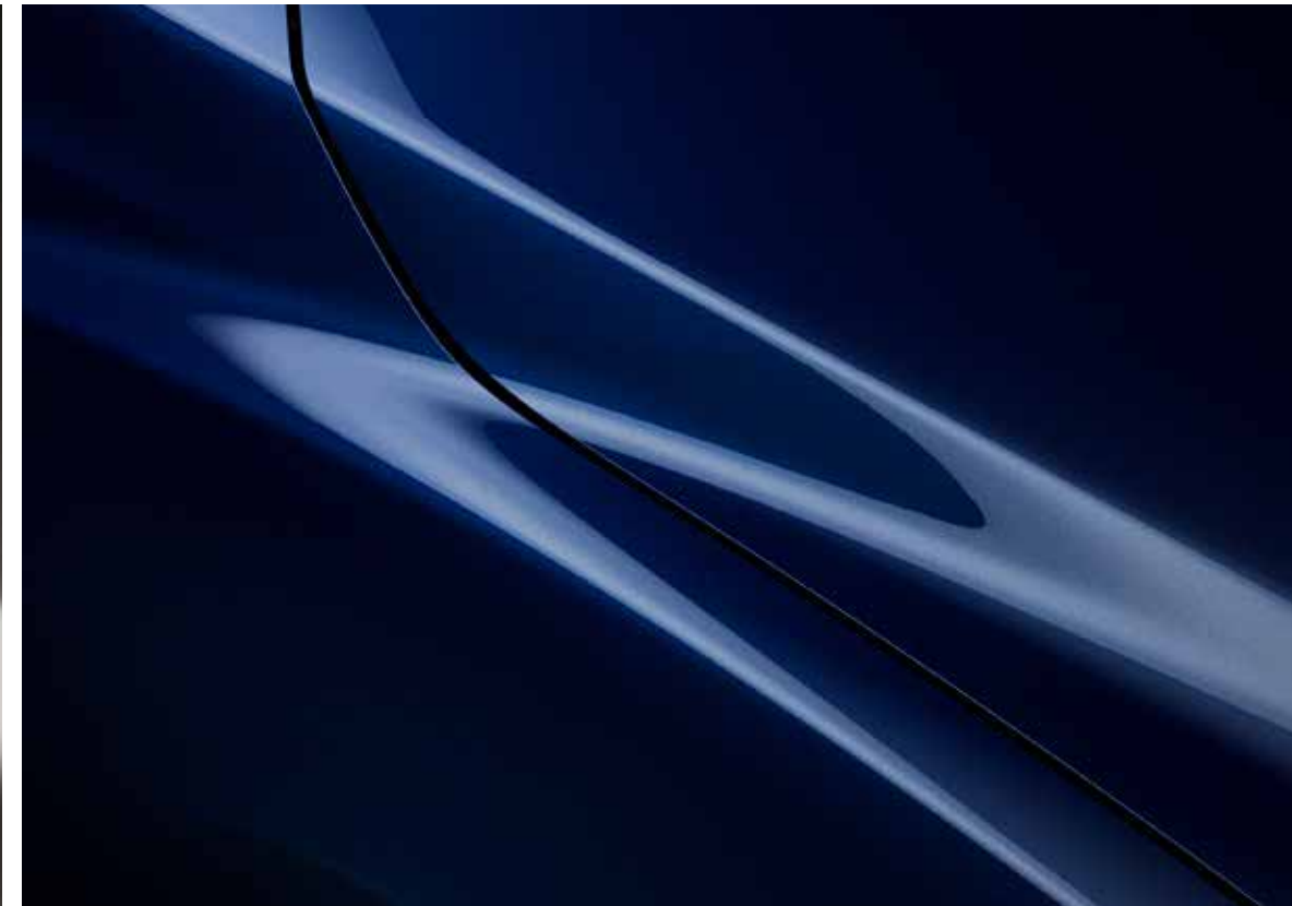
Deep Crystal Blue Mica